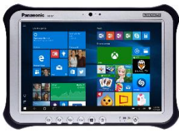
TOUGHBOOK G1 10" Windows tablet