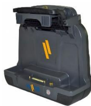
Havis G1 Vehicle Dock